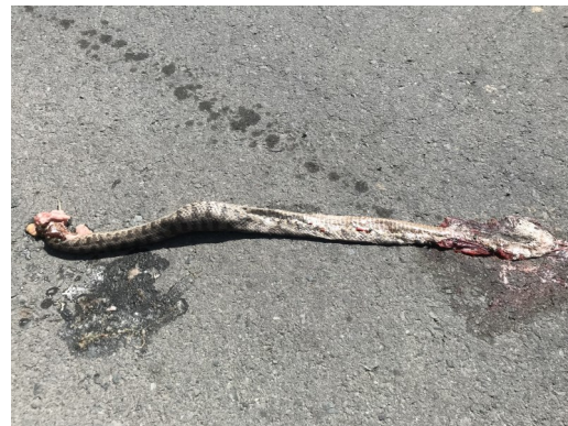
Viper roadkill ( Macrovipera lebetina )-