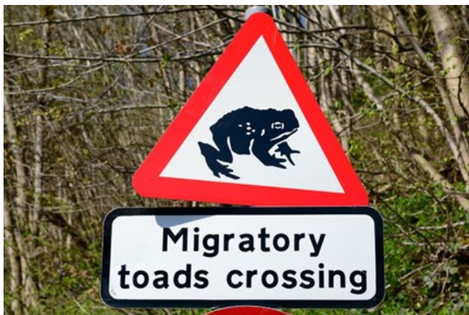
Material from Activity 3 (vocational training) "Traffic Signs"