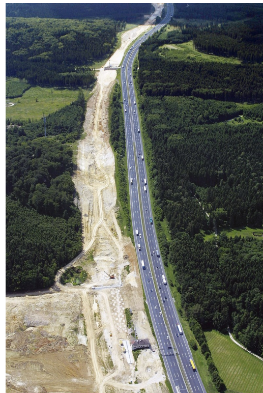
Road construction -